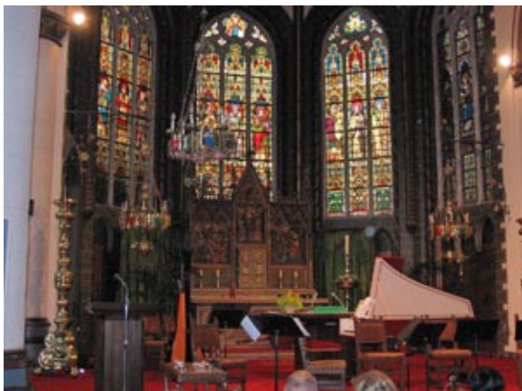
St. Gillis Church

Part of my plan was to discover the town of Bruges (Brugge). The connection from the Brussels airport to Bruges or any city within the country (or to Paris 1 hour and 20 minutes) couldn't be easier. I learned that the trains are the best way to travel through Belgium.